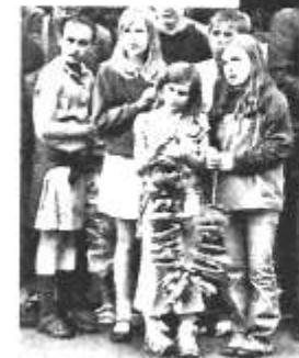
St Wilfrid's School children with their garlands and some of the guests they garlanded