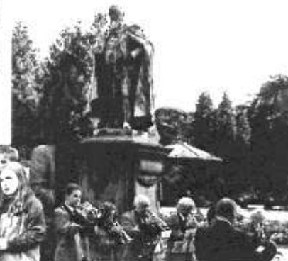
Ripon City Band and the Marquess